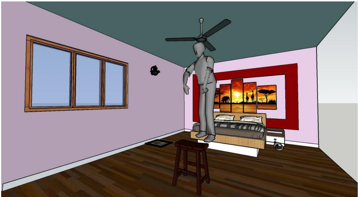
Graphical representation to show Hardik hanging and stool used for hanging