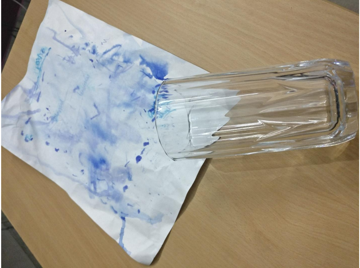
A glass of water emptied on a sheet of paper washing away its contents